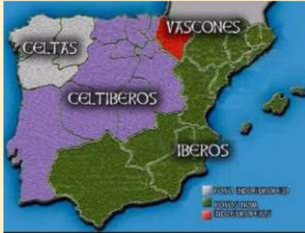
A map of Spanish cultures in pre-Roman times

While disputed, the Toros de Guisando near Avila are believed to be an example of Celtic Spain art