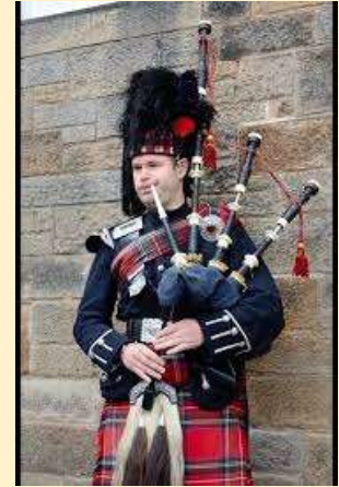
The Spanish Gaeta (left) and the Scottish Bagpipe (right)