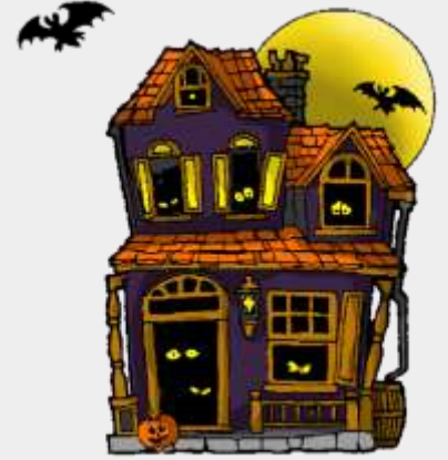
Going to a haunted house